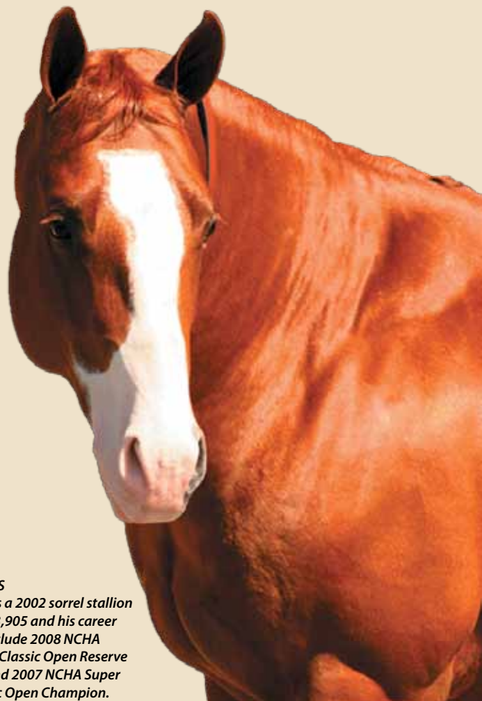
HALREYCIIOUS Halreycious is a 2002 sorrel stallion with LTE $223,905 and his career highlights include 2008 NCHA Super Stakes Classic Open Reserve Champion and 2007 NCHA Super Stakes Classic Open Champion.