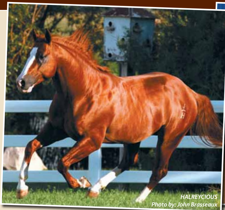
HALREYCIUS

Home of Dual Rey, Rey Dual, Stylish Rey and Halreycious