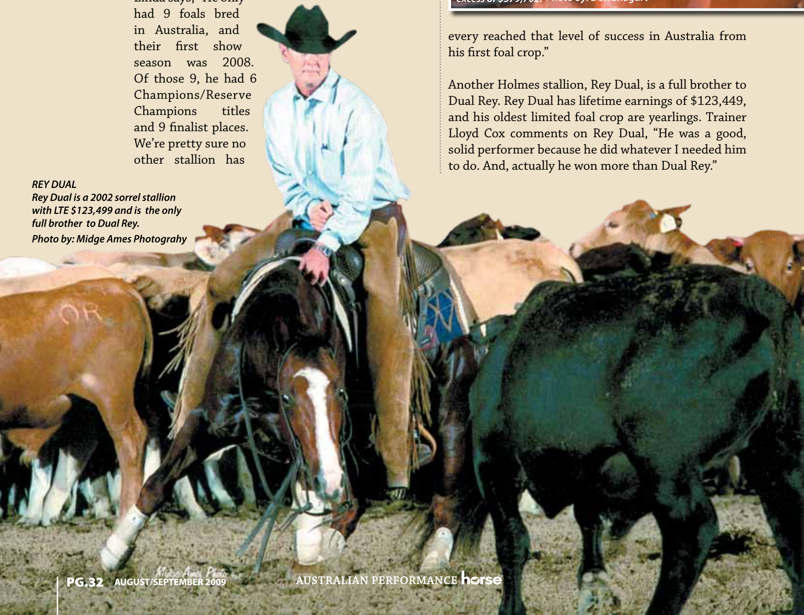
REY DUAL Rey Dual is a 2002 sorrel stallion with LTE $123,499 and is the only full brother to Dual Rey.