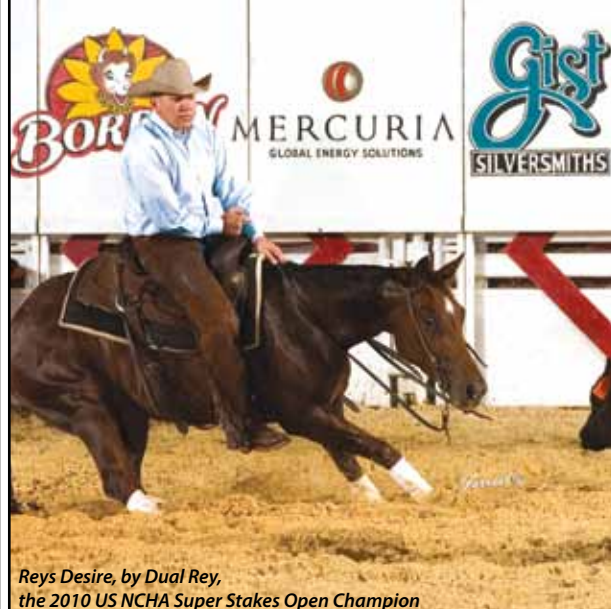
Reys Desire, by Dual Rey, the 2010 US NCHA Super Stakes Open Champion

pulls up and feeds for the rest of the day without a care in the world. He has a great temperament. Once I rode him it was confirmed."