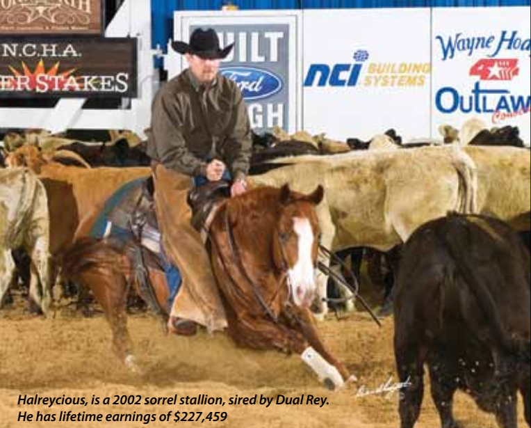
Halreycious, is a 2002 sorrel stallion, sired by Dual Rey. He has lifetime earnings of $227,459