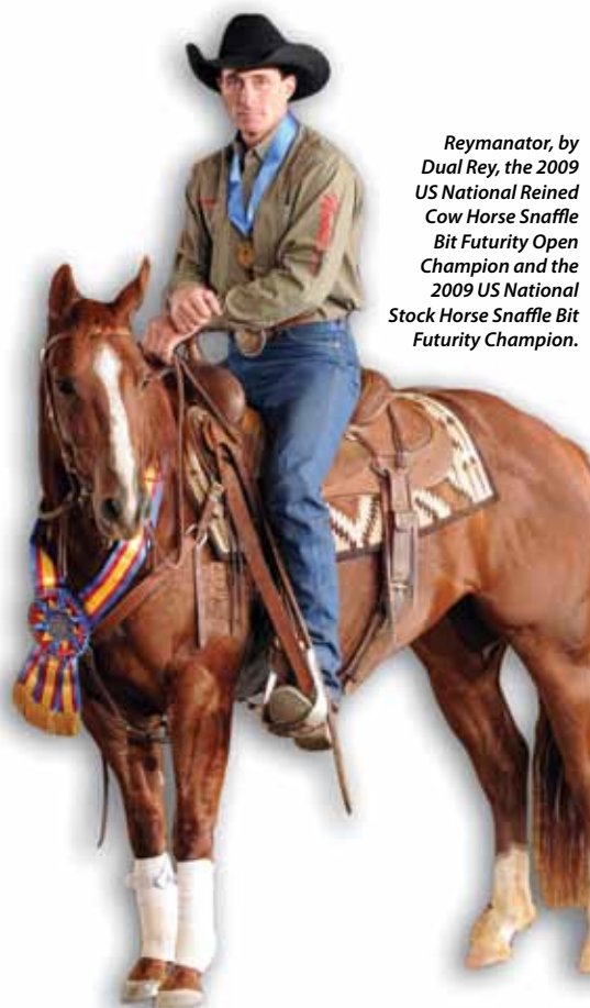
Reymanator, by Dual Rey, the 2009 US National Reined Cow Horse Snaffle Bit Futurity Open Champion and the 2009 US National Stock Horse Snaffle Bit Futurity Champion.